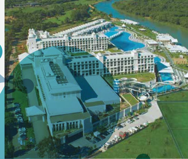
Titanic Deluxe Golf Belek

The symposium will host ISO TC 209 delegates from 23 member countries developing ISO 14644 standards and we will be getting first hand information about the future of the standards. This will also be our first hosting for the annual meeting of ICCCS CoD meetings and board of directors in our country. During three days in full, we plan to make you meet global brands and important names of the sector and make the best of it through different panels, trainings, technical trips and sessions.